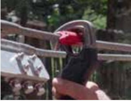
CLiC-iT compatible with C-ZAM RiDER See page 36