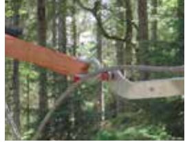
Assembly with ELINGUES