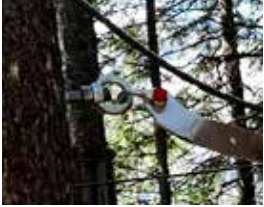
Assembly with LE CLOU See page 46