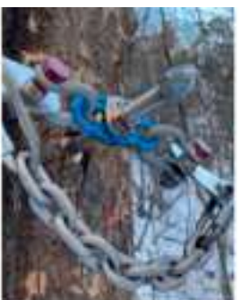
Examples of connectors